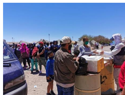
Venezuelan families receiving assistance in Huara